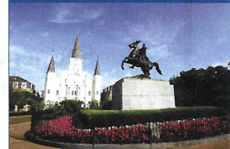
GUIDED TOUR OF NEW ORLEANS