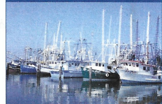
The Beautiful Gulf Coast Awaits

Day 6: Today after enjoying a Continental Breakfast, you depart for home... a perfect time to chat with your friends about all the fun you had and where your next group trip will take you!