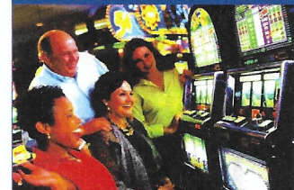
Give Lady Luck a Spin!