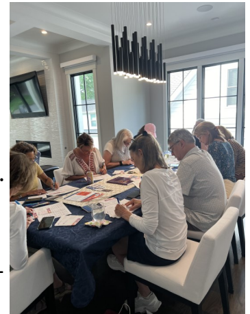
Members gather to write GOTV postcards together.