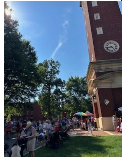
The Fourth of July Parade kicks off at the Queens University Bell Tower.

Leaguers greeted community members, handed out “future voter” stickers and treats to kids, and made a loop around the Queens University campus in the parade.