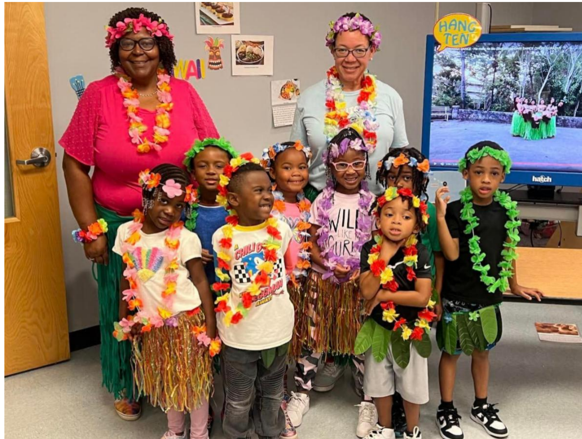
Students at Highland Charter Head Start in Gastonia enjoy "Around the World" Summer Enrichment Program