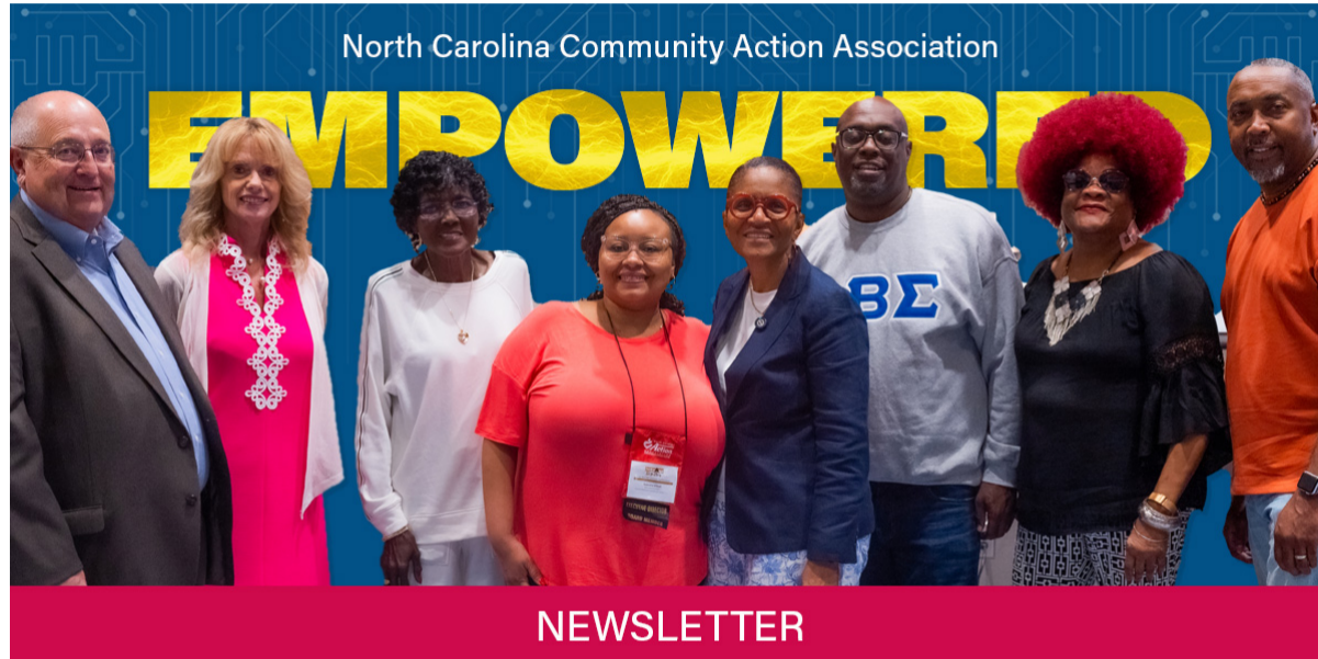
NCCAA board members at our Annual Conference in Cherokee

Empowered Newsletter | July 2024 | Issue 7