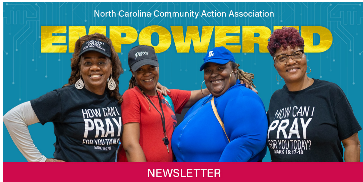
Volunteers at our Kinston, NC, DIAPER Project resource event

Empowered Newsletter | November 2023 | Issue 11