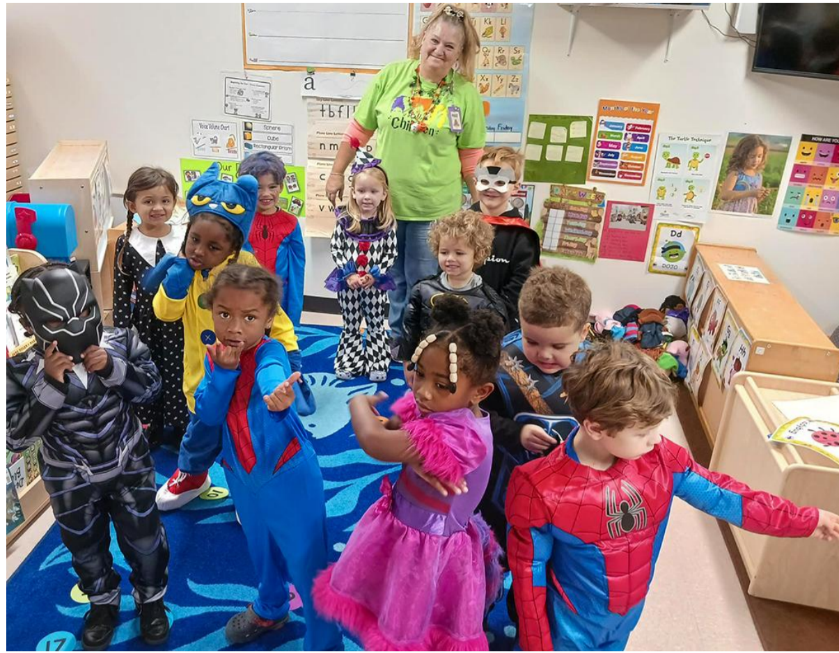
Here's another image from one of our agencies. The students at Blue Ridge Community Action's Northside Center had their Halloween game going on! Webs were being slung!