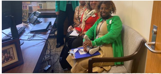
Home Health Care Advocates