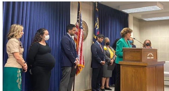
Senator Marcus addresses the press

Last week I stood in the NCGA press room with fellow Senate Democrats and citizen advocates to highlight our plan to Put Families First with policies that respect reproductive freedom by Codifying the Protections of Roe and Casey, reduce gun violence, address inflation and household budgets, provide better mental healthcare,