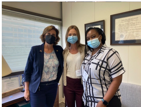
North Carolina Association of Nurse Anesthetists