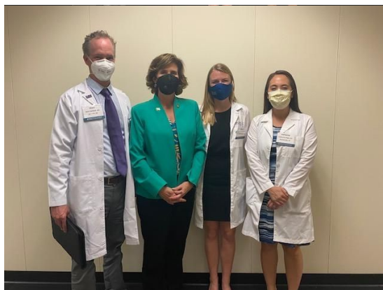
North Carolina Academy of Family Physicians