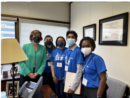
American Cancer Society