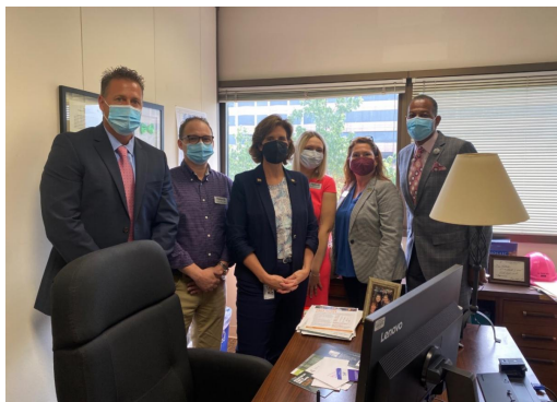
Meeting with Huntersville Mayor and Commissioners. We discussed the importance of education and transportation funding and the need for research funding for ocular melanoma.