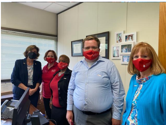
Leukemia and Lymphoma Society

I met with numerous health care providers over the past few weeks to discuss legislative proposals. In every group we celebrated the incredible milestone of finally passing Medicaid expansion in the Senate. We also discussed advocating for cancer patients (and the impacts of ocular melanoma in the district), the importance of comprehensive healthcare services, and the need for fair wages for all direct care workers. We also discussed the provisions of the SAVE Act.