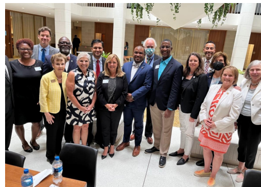
Mecklenburg Delegation Members with Mecklenburg County Commissioners and the County Manager. We met on County Commissioner Advocacy Day.