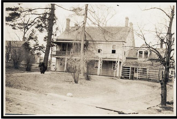
Howard Orphan Asylum

Mary Mahoney worked as a nurse for the next four decades. During her 40-year career she attracted a number of private clients who were