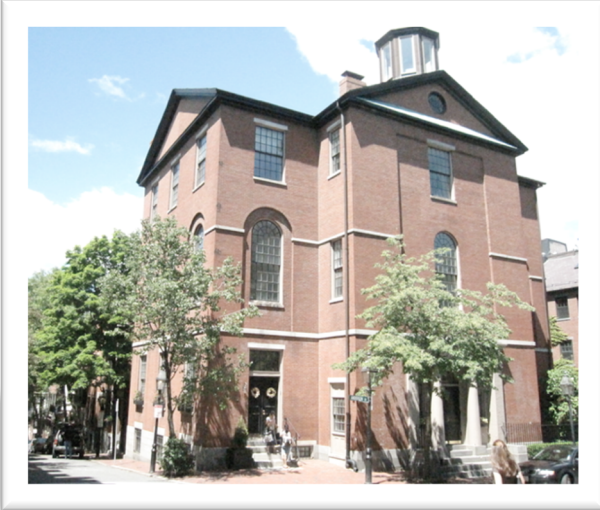
The Phillips School

Mary Eliza Mahoney was born in 1845 in Dorchester, Massachusetts. Mahoney's parents were freed slaves, originally from North Carolina, who moved north before the American Civil War in pursuit of a life with less racial discrimination.