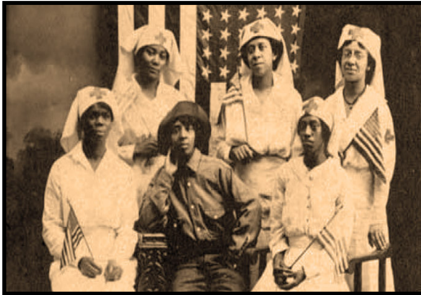
Mary Mahoney (bottom row, center) activist/advocate for African Americans in the nursing profession.

In 1909, Mahoney spoke at the the National Association of Colored