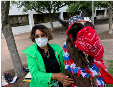
Senator Waddell meets with constituents from Mecklenburg County.