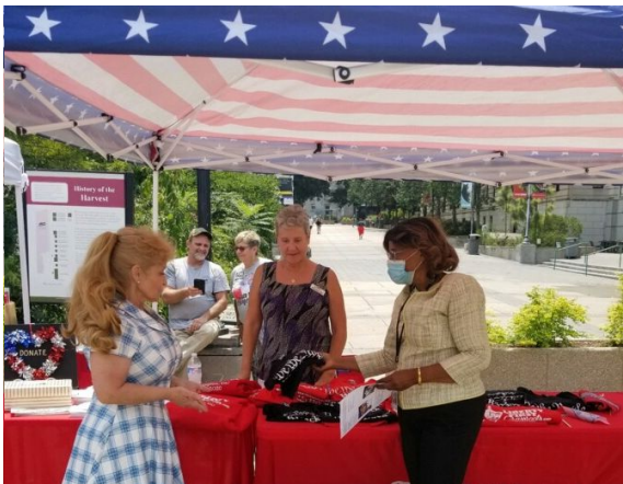
Senator Waddell checks out a vendor and provides information on upcoming legislation