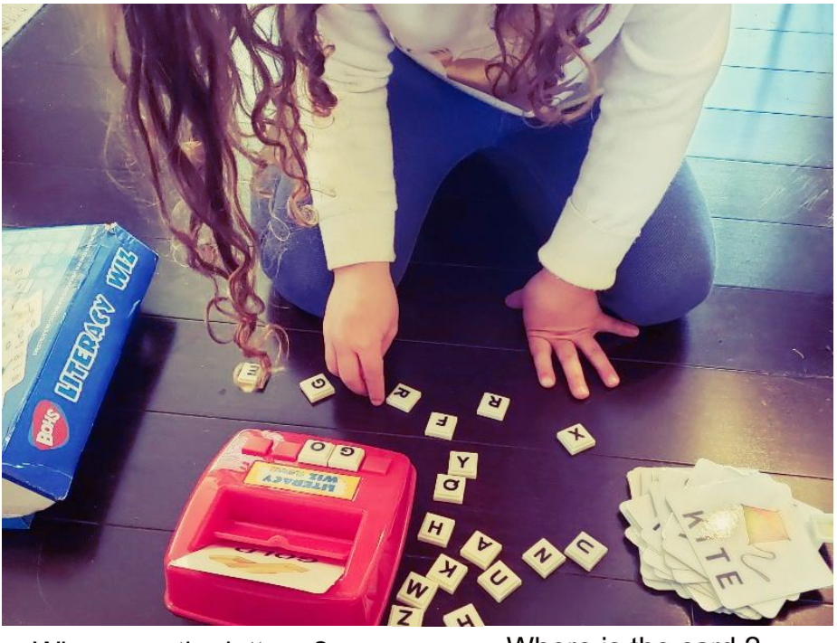
Where are the letters?