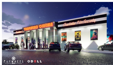
Rendering of the theatre