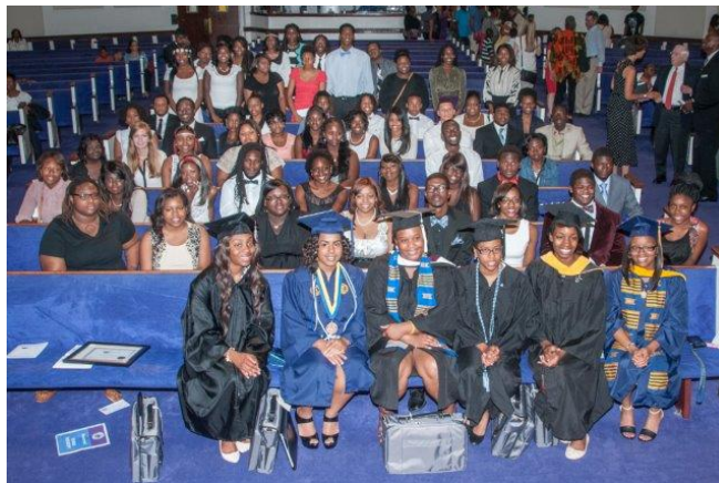
CHASF graduates & recipients during the 31st Awards Day.

After the ceremony, guests enjoyed a buffet dinner and desserts to celebrate their achievements!