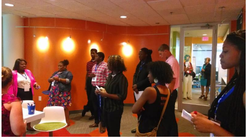
CHASF Scholars tour the Belk headquarters in Charlotte as guests of several Belk employee groups.

Belk employees coordinated the Third Annual "Day-in-the-Life at Belk" where a dozen Charlotte Housing Authority Scholarship Fund recipients spent a half-day at the headquarters meeting with professionals and learning the secrets of corporate success.